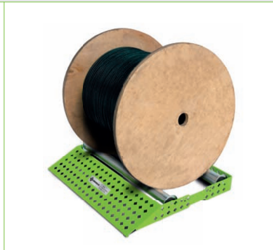
Easy Roller Broad (710 x 605 x 95 mm)