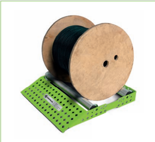
Easy Roller Standard (605 x 570 x 90 mm)