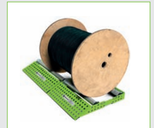
Examples of application